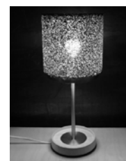
Hi-tech table lamp