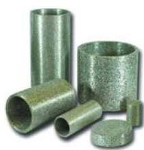
Filters of various designs

At present, porous aluminum is used to produce gas and liquid filters, air silencers, sound absorbing panels, dampers, bubblers, heat exchangers, flame arresters, heat pipes, wicks, gas and liquid permeable protective housings, liquid evaporators, liquid aeration, vacuum tables, current collectors in new generation rechargeable batteries, structural engineering products with lower weight and thermal expansion, cooling radiators for electronic components, design of high-tech objects, etc. (figure 1).