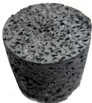
Figure 3. A porous preform from mother alloy for introduction into ultra- and nanomaterials pores.