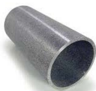
Permeable sensor housing