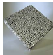
Sound absorbing panel